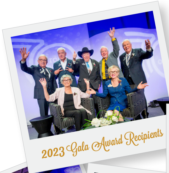
2023 Gala Award Recipients