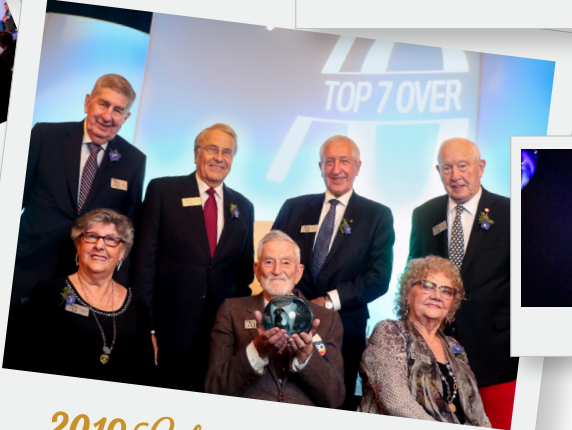
2019 Gala Award Recipients