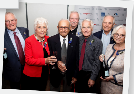
2017 Gala Award Recipients