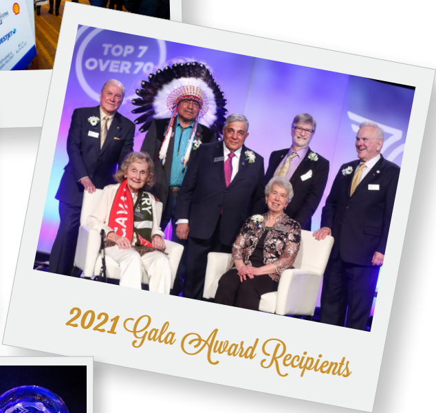
2021 Gala Award Recipients